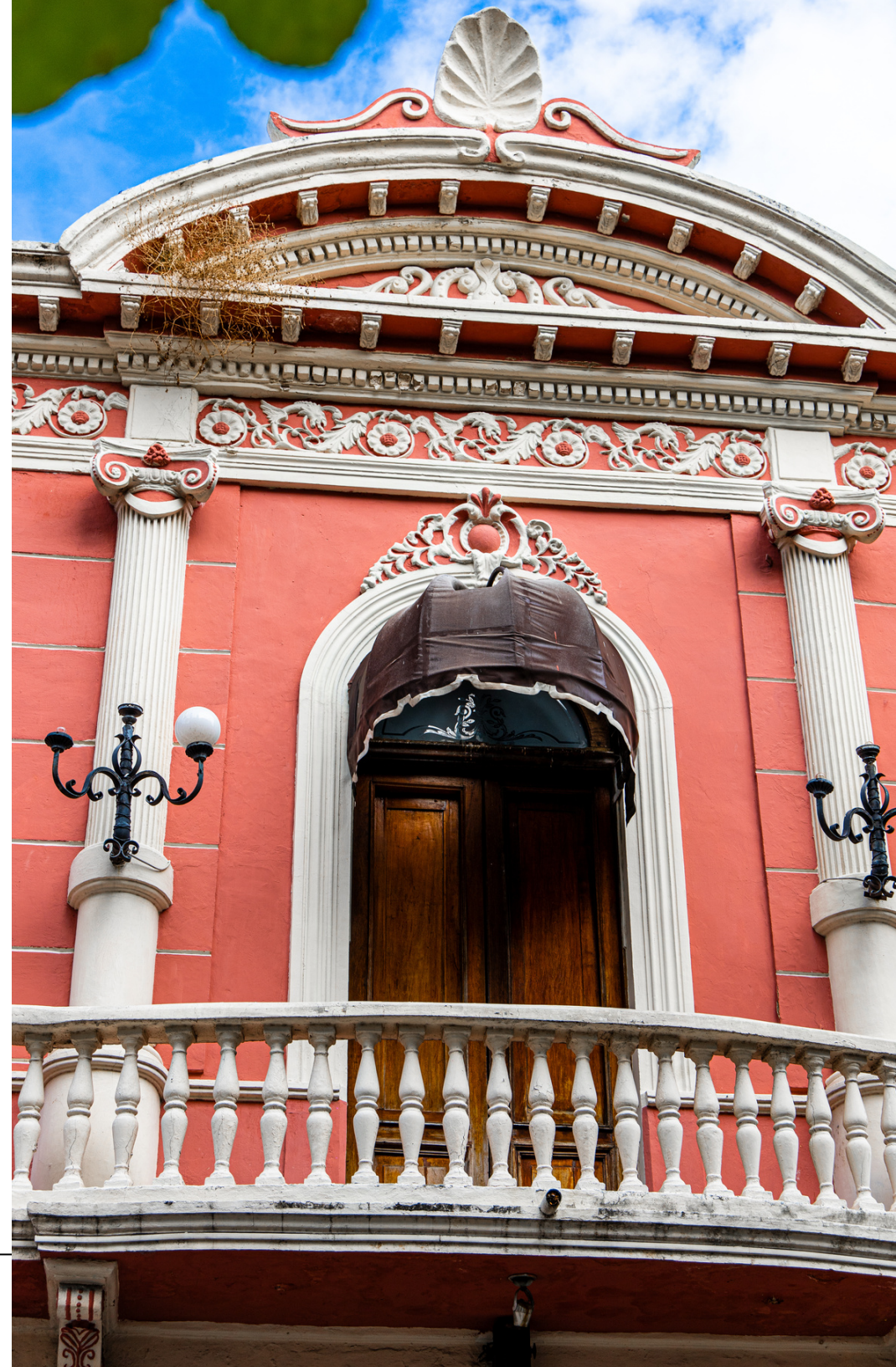
Image: Rafael Heredia-Abuxapqui available exclusively at SoHo Galleries